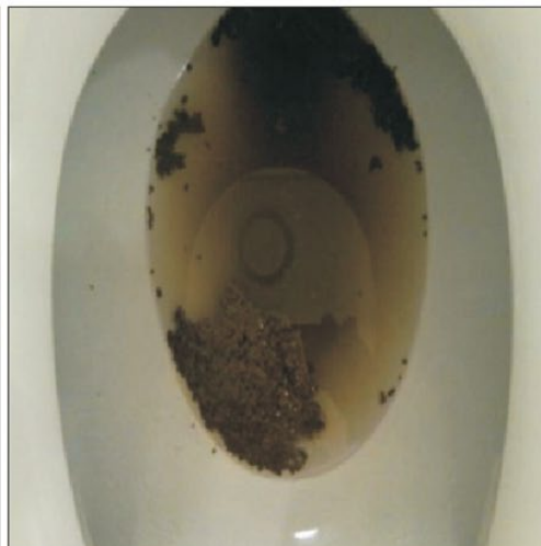
Semil-solid stool (5)