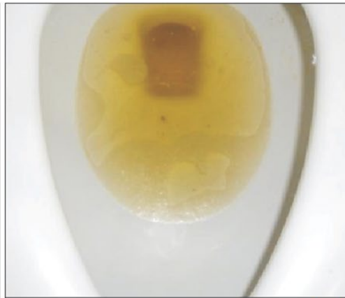
Turbid liquid (2)