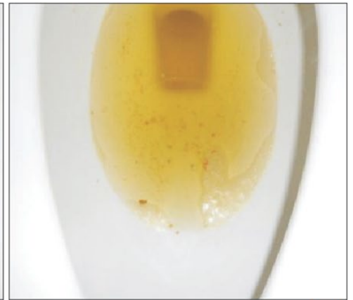
Particulate liquid (3)