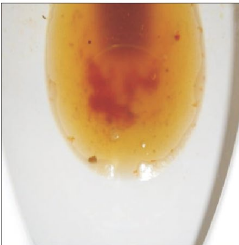
Liquid with small amount of feces (4)