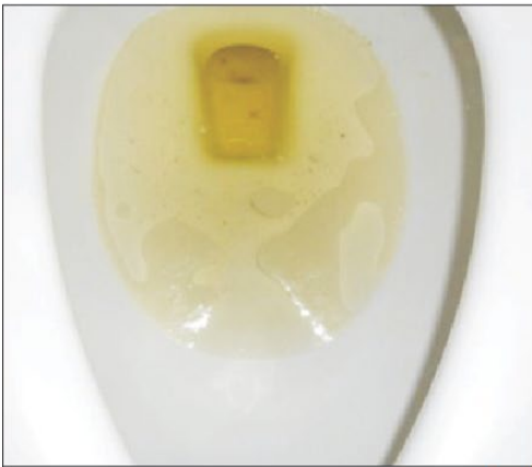
Clear liquid (1)